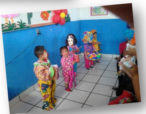
made by them.