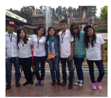
At the end of the period students went on an

Evaluation to cover the second unit of studies were carried out May 18 – 21.