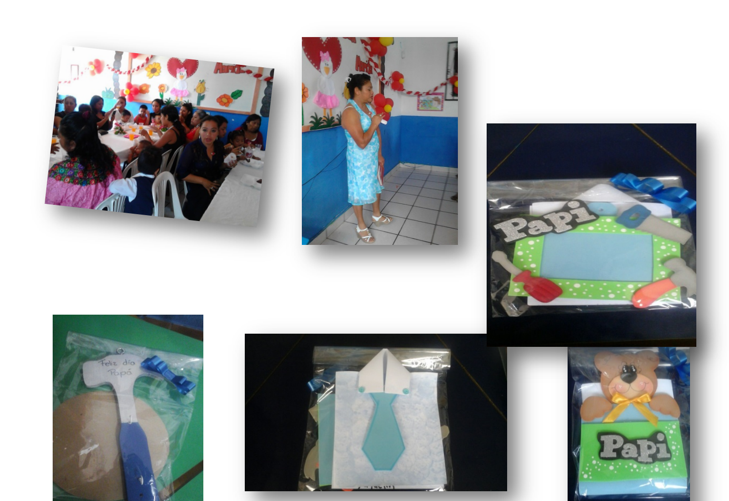
Father's Day was celebrated on June 17<sup>th</sup> as well. Children gave crafts and cards made by them to their dads.