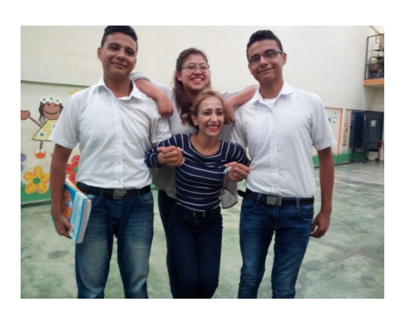
STUDENTS HAVING FUN WITH ME