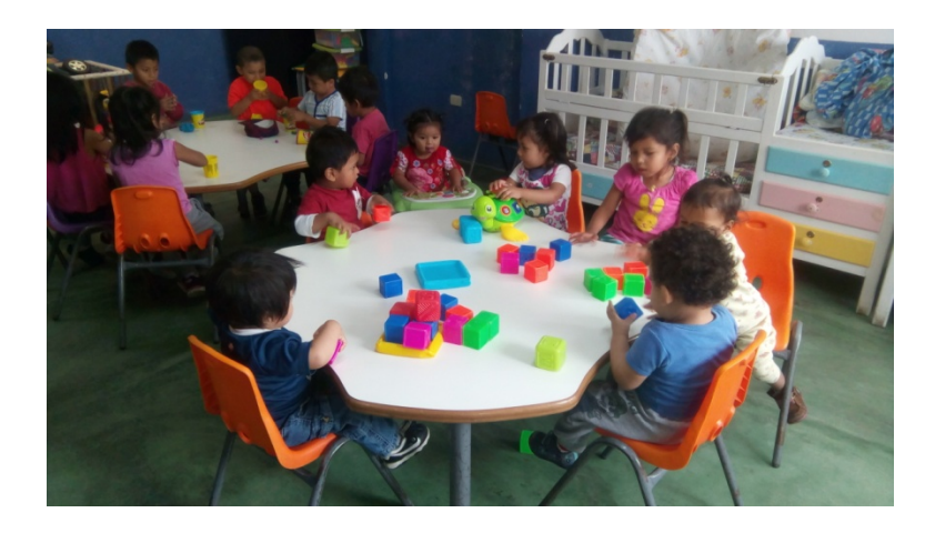
Motor skill activities with boys and girls