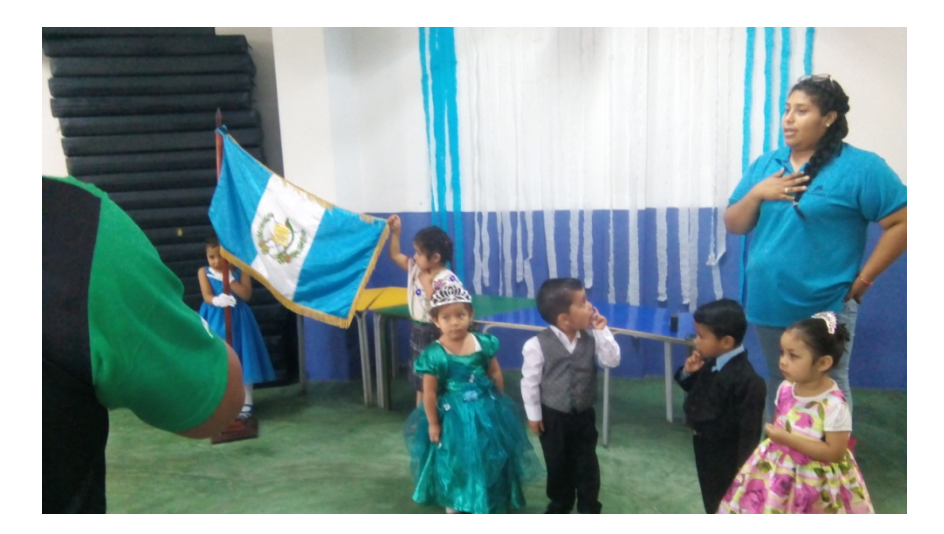
Independence day celebration