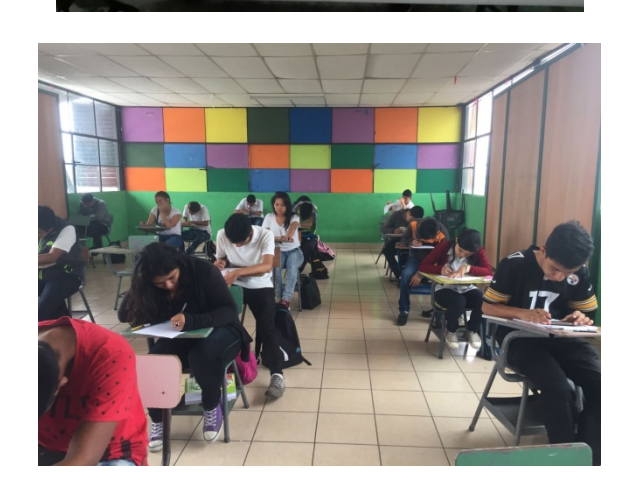
STUDENTS TAKING EXAMS

\overset{\wedge}{\wedge}\overset{\wedge}{\wedge}