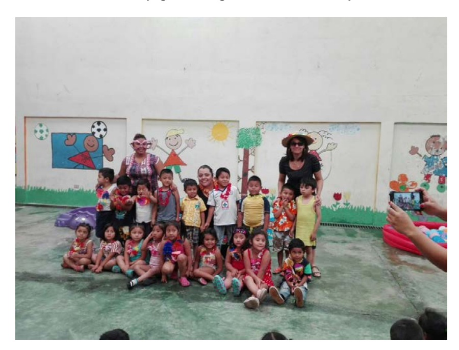
Summer Day activity