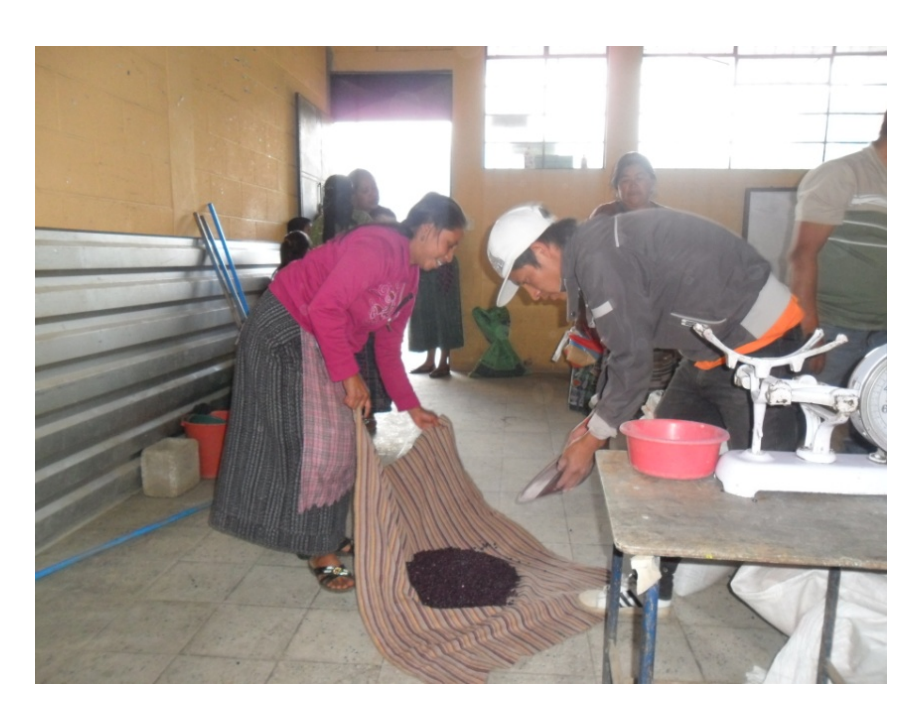
Monitoring visits to corn and bean plantations