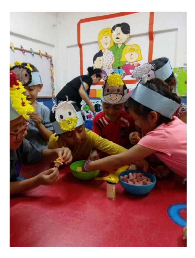
Activities in classrooms