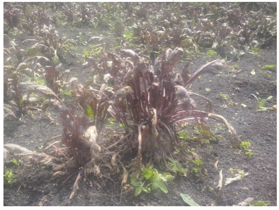
Cultivation of vegetables (beet) destroyed by volcanic sand