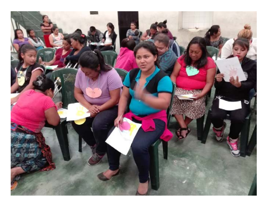
Family gatherings with our nursery