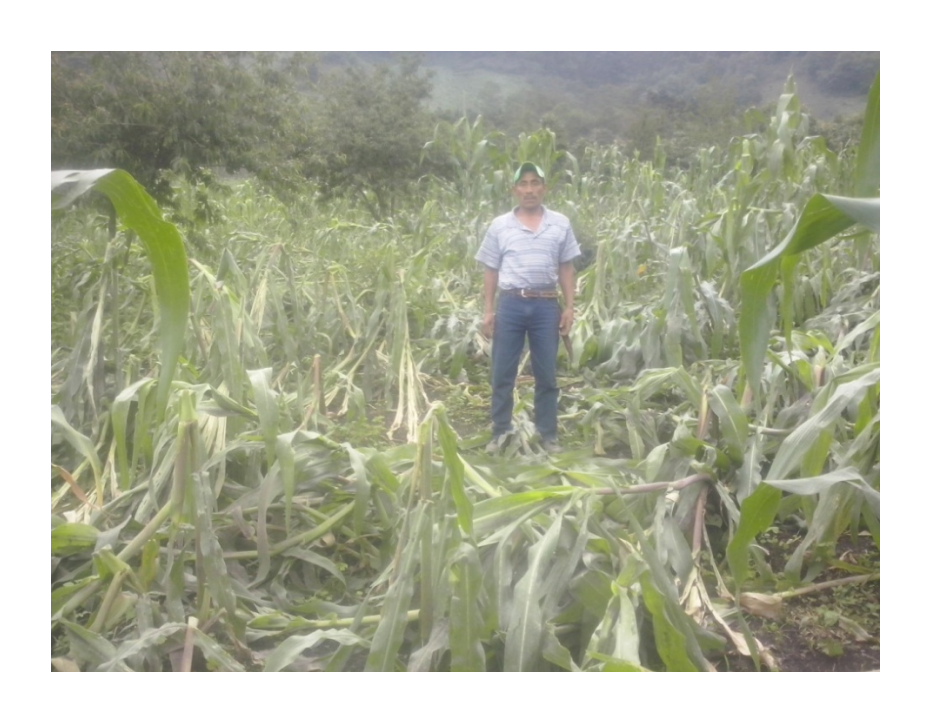
Cultivation of maize affected by volcanic sand