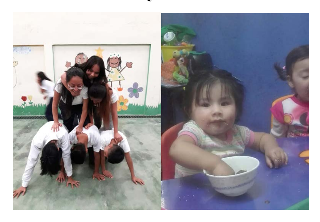
GUATEMALA AGOSTO DE 2018