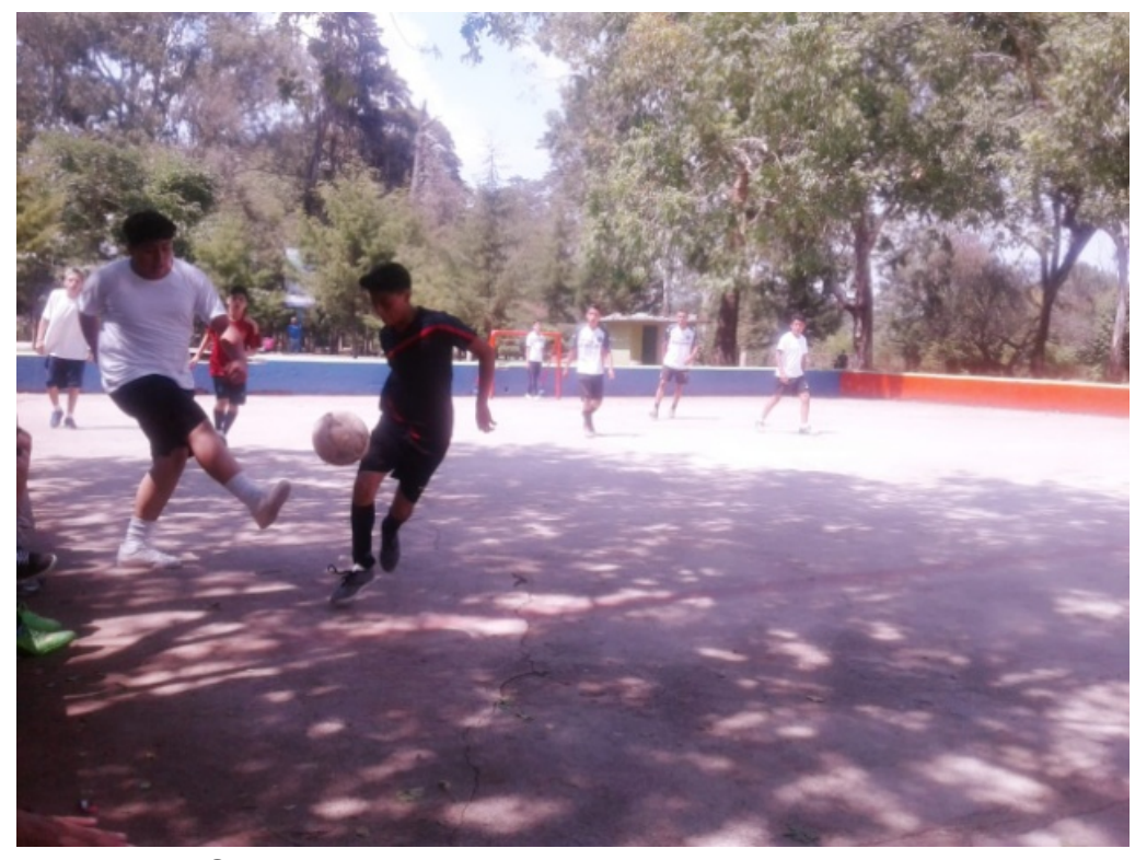
Sports and recreational activities with students.