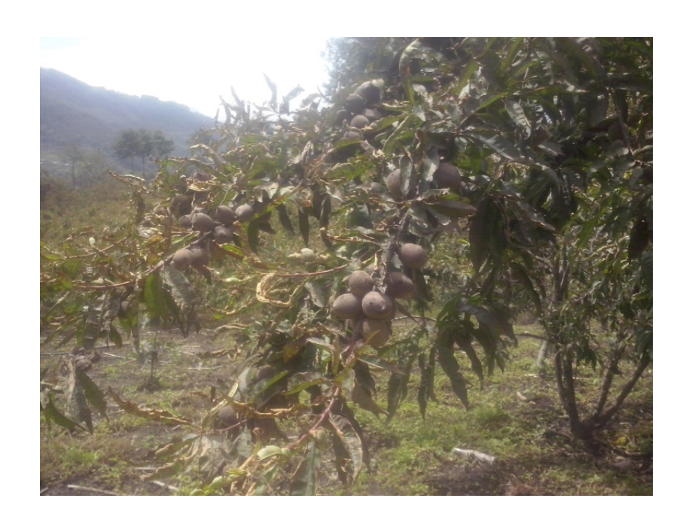
Fruit cultivation (peach) affected by volcanic sand