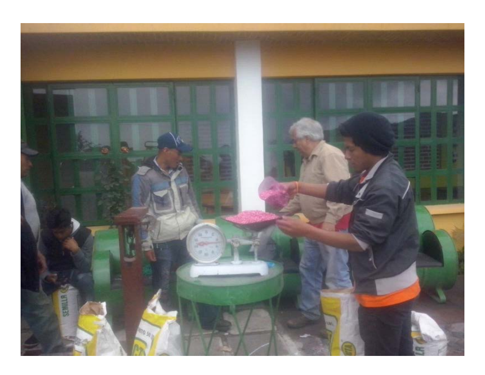
Giving seeds to the comunity